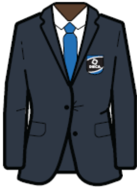
OFFICIAL DECA BLAZER WITH COLLARED DRESS SHIRT & APPROPRIATE NECKWEAR

DRESS CODE WHEN APPEARING BEFORE JUDGES AND ON-STAGE AT ICDC