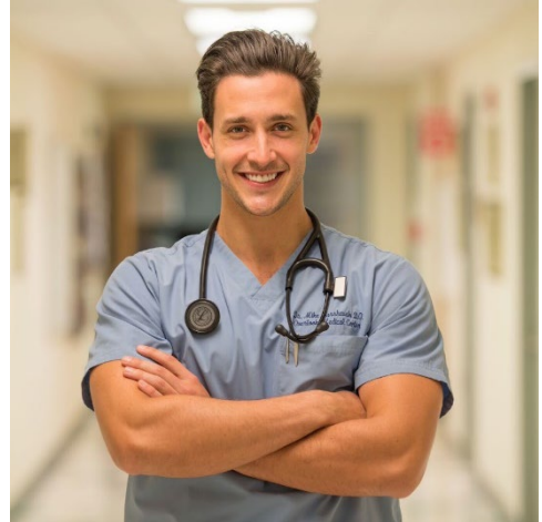
Keynote speaker at the 2022 International Leadership Conference, Dr. Mike Varshavski