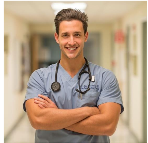
Keynote speaker at the 2022 International Leadership Conference, Dr. Mike Varshavski